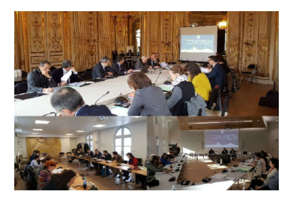
Meetings to present the new instruction to the partners in February 2018

(continued from page 1). It must include measures to prevent illegal camps and slums being set up again. This action must necessarily involve the local communities concerned, whose commitment is essential, as shown by the examples of Strasbourg and Toulouse which have significantly reduced the number of slums in their area. This new instruction from the Government is the result of development work which brought together representatives of the local communities, decentralised State services, associations, providers, researchers and stakeholders in the local area. DIHAL is responsible for monitoring the implementation of this circular and from now on is committed to its mobilisation. On the 5th, 12nd and 13rd of February, the DIHAL has respectively brought together the inter-ministerial steering committee, the national monitoring group and the relevant Departments.